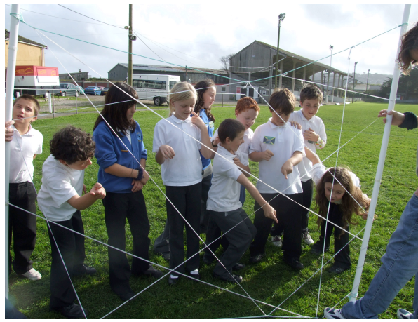
Team Work at the Pirates Learning Zone