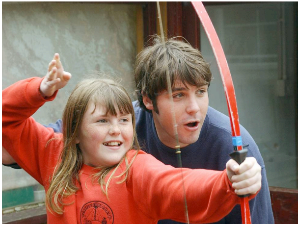
Archery at the Delaware Adventure Zone