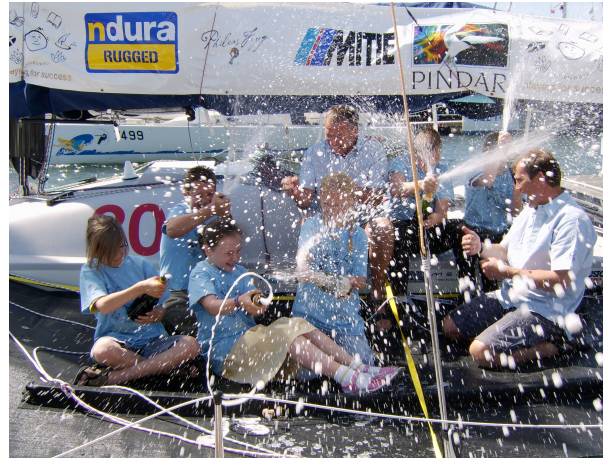
Celebrating the naming of the 'Cornwall Playing for Success.'