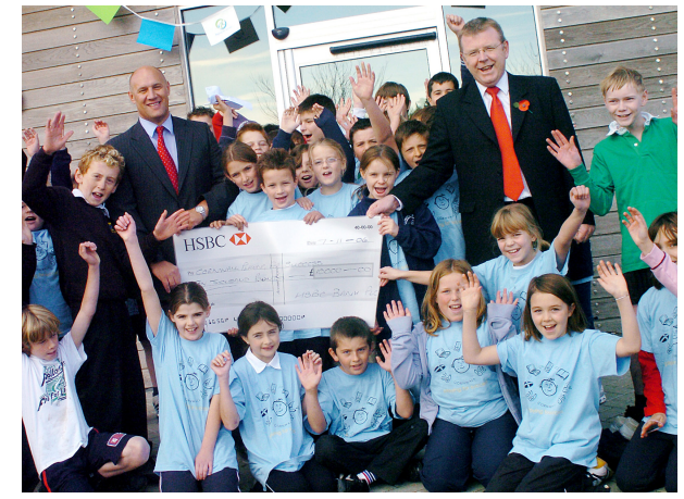
The Porthpean Launch