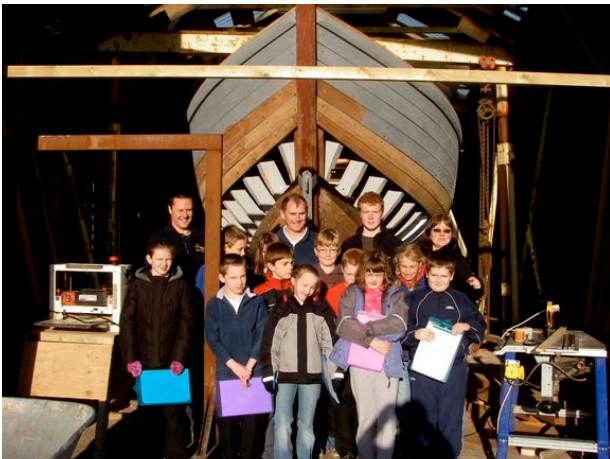
DAZL pupils at the Spirit of Mystery