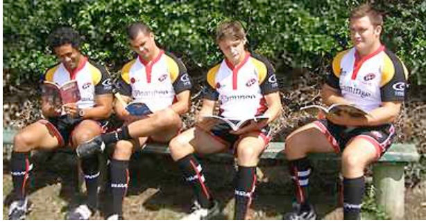
Cornish Pirates reading champions